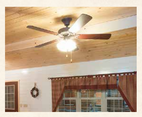
High-quality lighting fixtures are standard. And there is no need to request ceiling fans, as they are already included in all bedrooms and living areas.