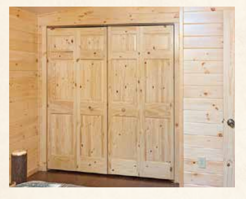
All interior doors (bedroom, bath, and closet) are knotty pine and solid wood construction.