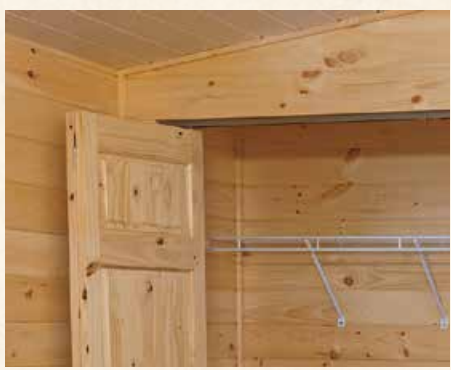
Shelving is included in all our closets. Coat closets and bedroom closets have one 12" shelf with a rod, while pantries and linen closets have four 16" deep shelves.