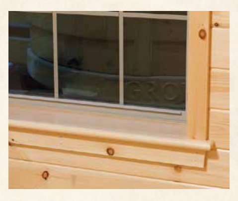
Remember those deep window sills on the old farm house? Our window sills are a full 8"deep and artfully crafted by our talented craftsmen.