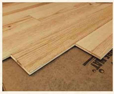
Engineered pine flooring is a standard part of packages. This flooring provides a stable and beautiful real-wood surface on top of our ¾" tongue & groove sub-floor.