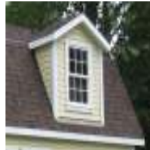
Dutch Dormer w/ Window