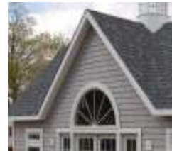
Extra Gable / A-Frame