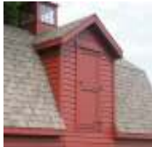
Dutch Dormer w/ Door