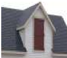
A-Frame Dormer w/ Door